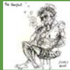
"Fuma &amp; Mira" 2004