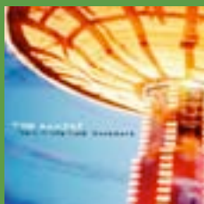
"This is the Time"- 2008