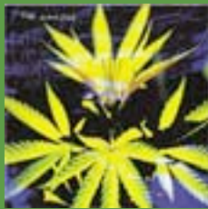
"The Ganzas"- 2003